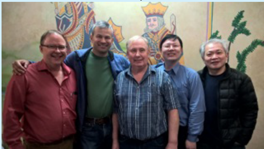
Team members (left to right):

Below: GNT Championship Flight winners. They will represent District 19 in the Grand National Teams at the Toronto Summer Nationals, July 19-23.