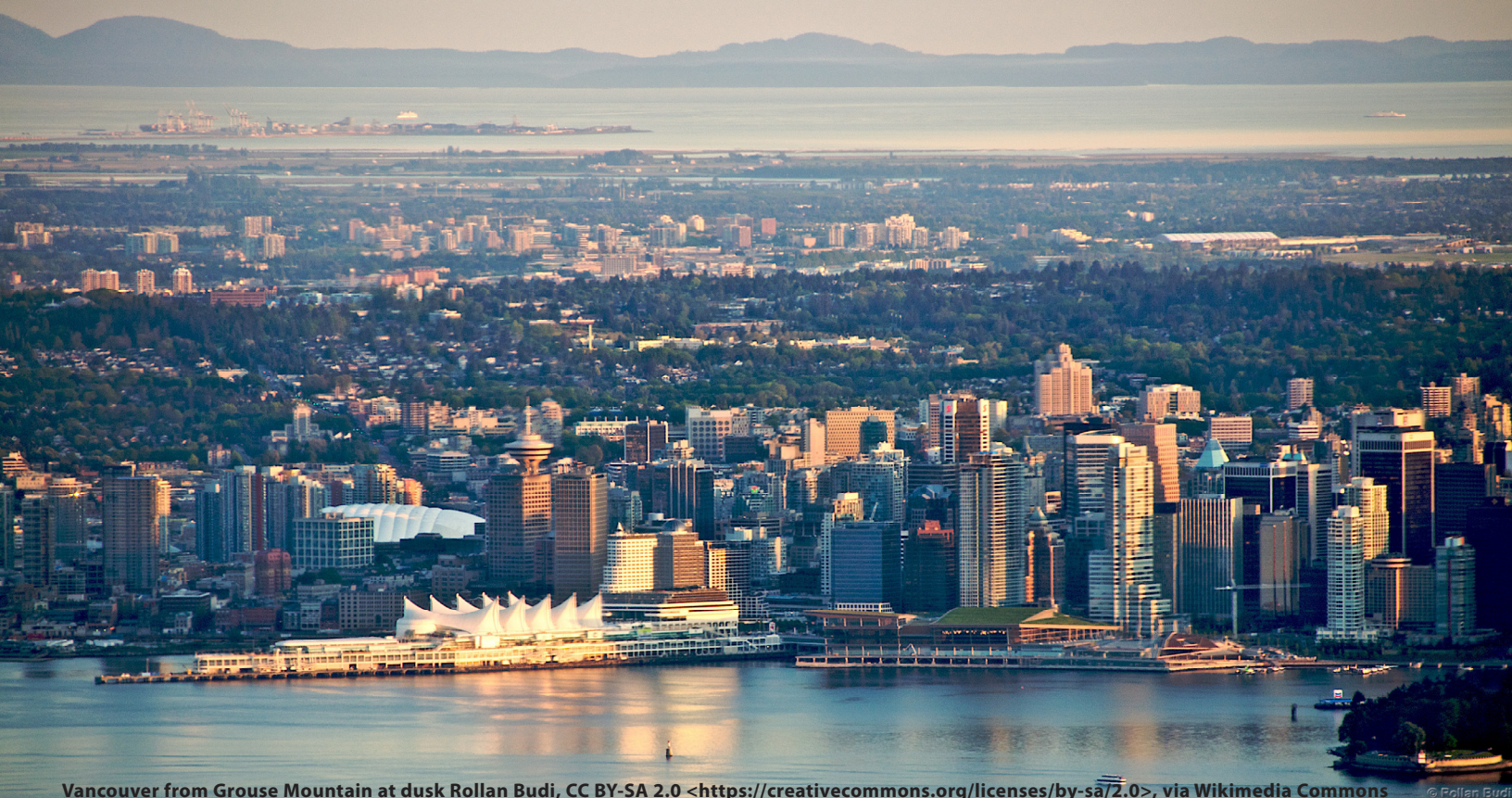
Vancouver from Grouse Mountain at dusk